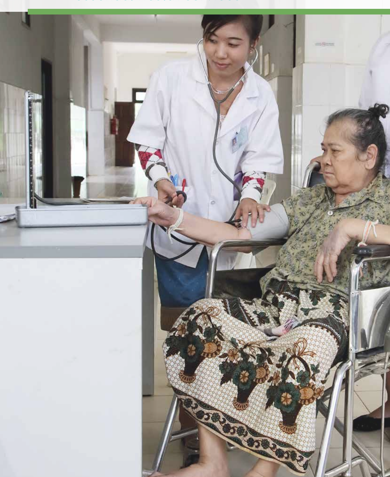
Part 1. Operational strategies for maintaining essential health services