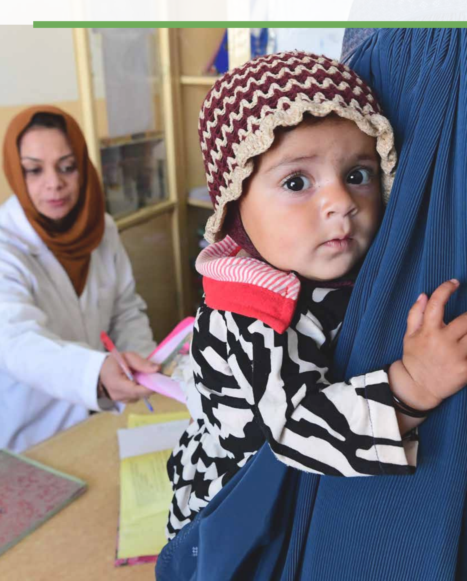
Part 2. Life course and disease considerations