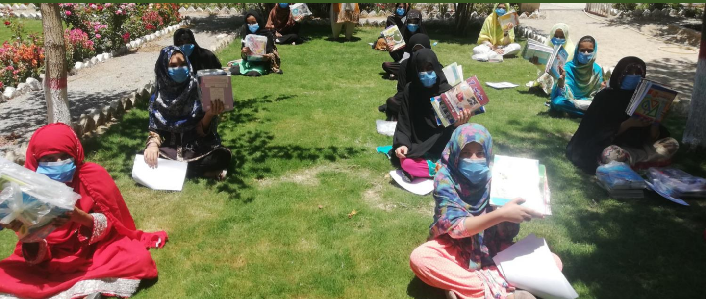
Mercy Corps distributed worksheets to students during closure of schools for continued education in Khyber Pakhtunkhwa