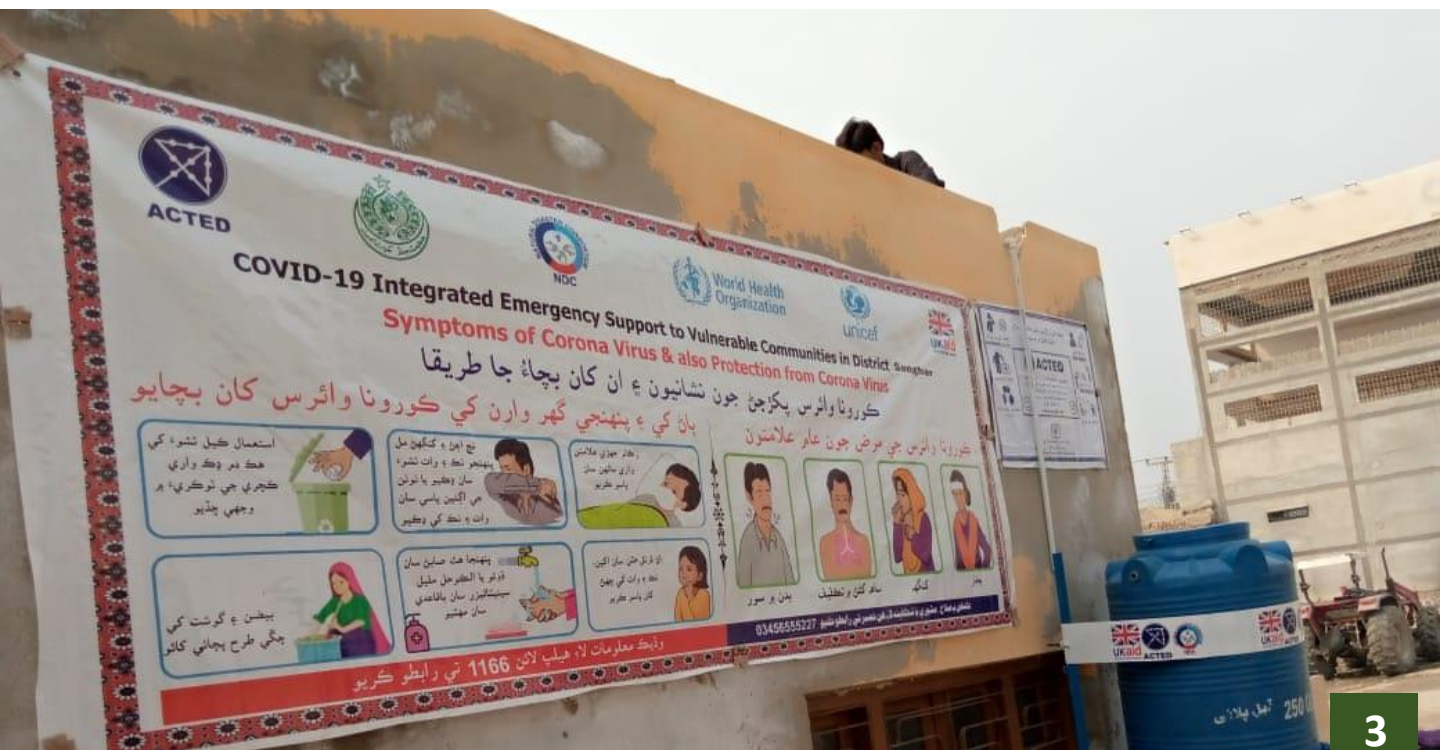
ACTED conducted awareness sessions across various districts in Sindh