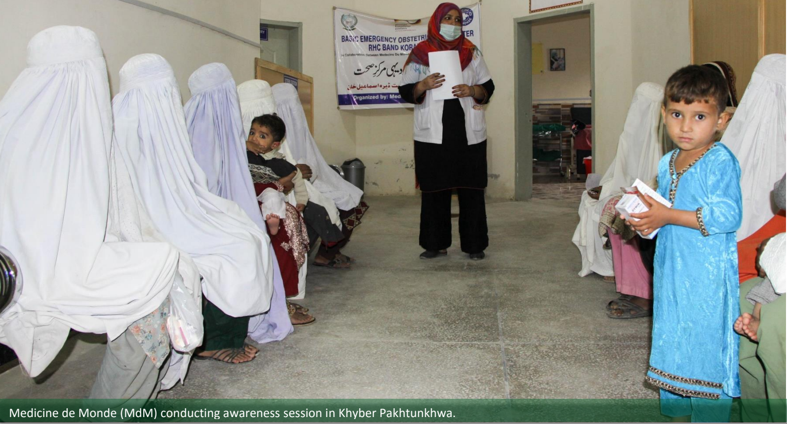
Medicine de Monde (MdM) conducting awareness session in Khyber Pakhtunkhwa.