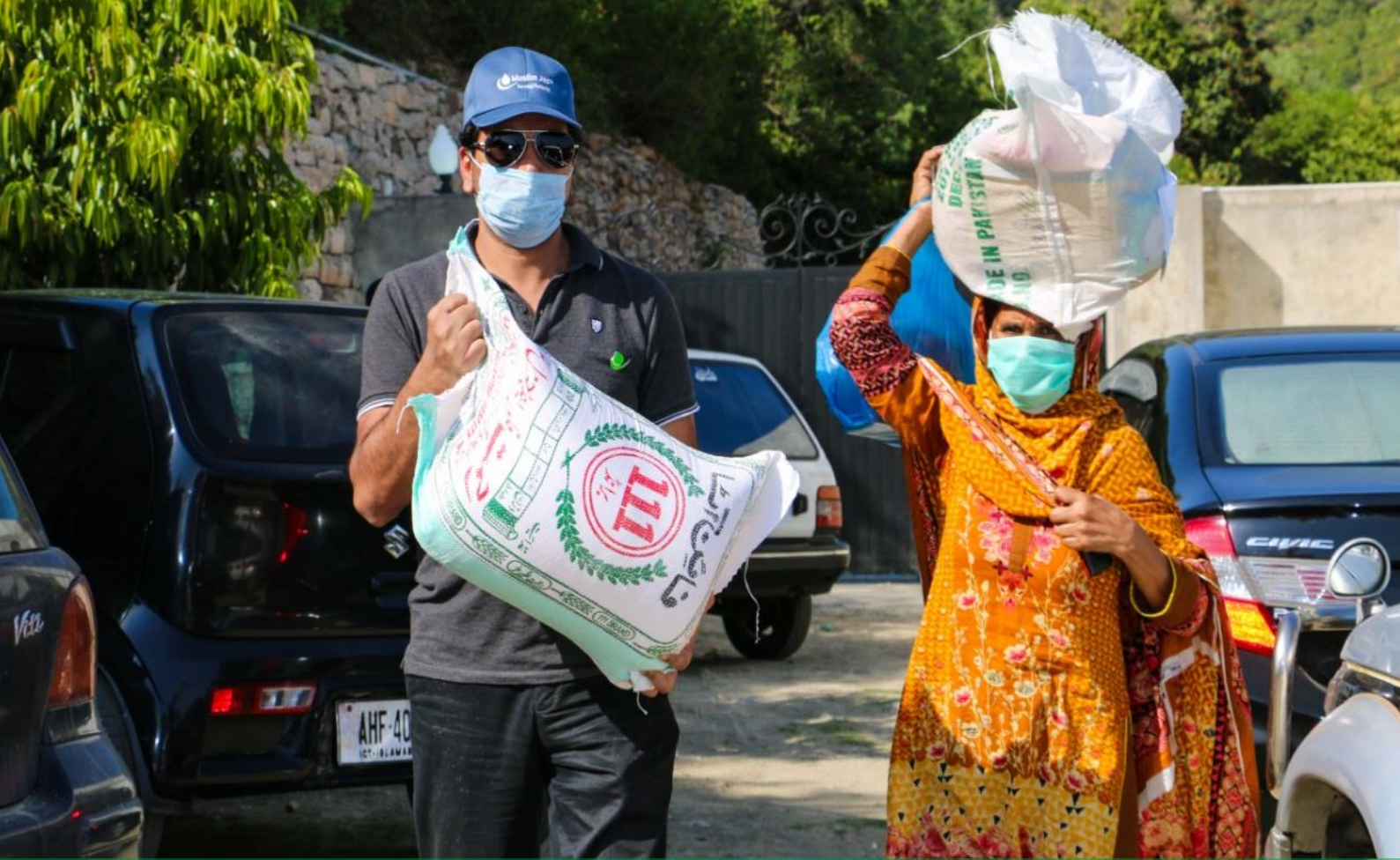
Muslim Aid distributing dry ration packages among vulnerable communities across Pakistan.