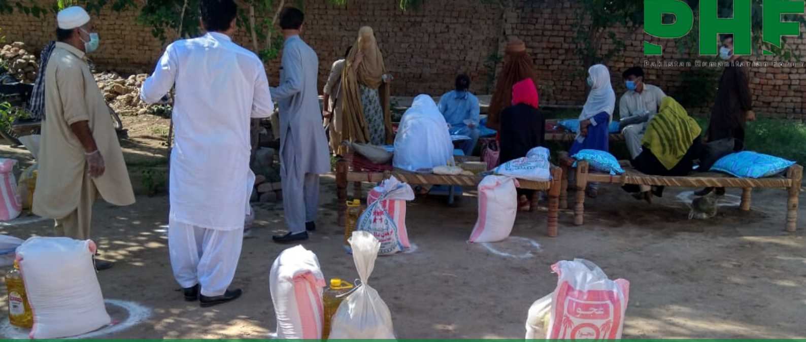
Handicap International provides health and hygiene kits and food package in Peshawar & Nowshera