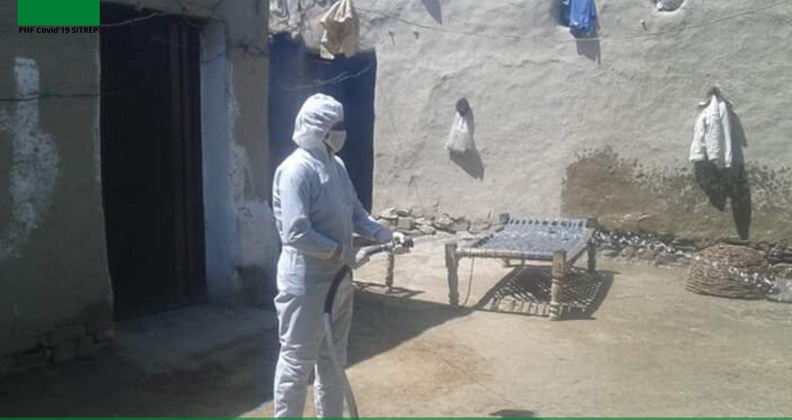
Disinfection drive begins, with supplies provided by IRC.