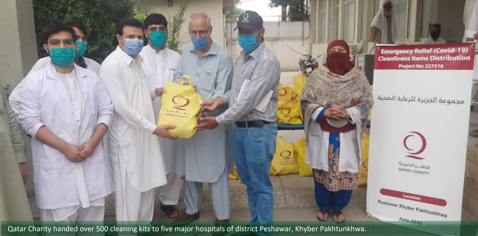
Qatar Charity handed over 500 cleaning kits to five major hospitals of district Peshawar, Khyber Pakhtunkhwa.