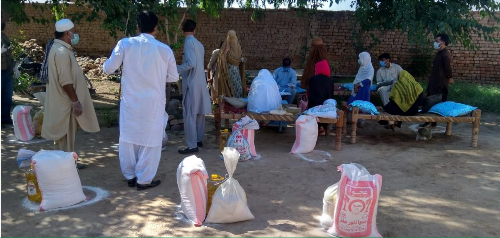
Handicap International provides health and hygiene kits and food package in Peshawar & Nowshera, Khyber Pakhtunkhwa.