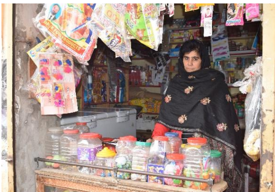
Recipient of financial assistance grant