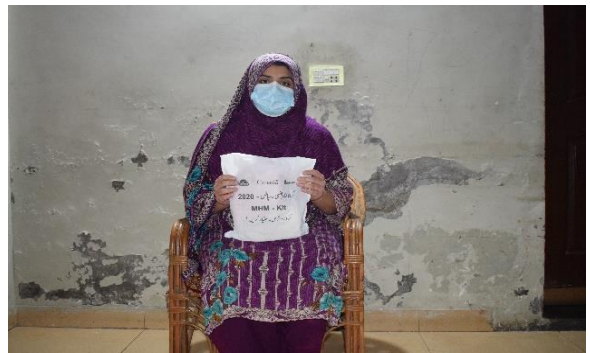
Orphan recipient of MHM kits