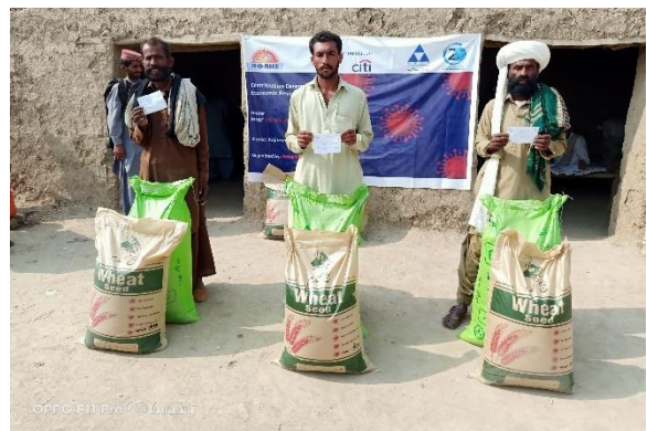
Agriculture inputs to smallholder farmers under economic revival