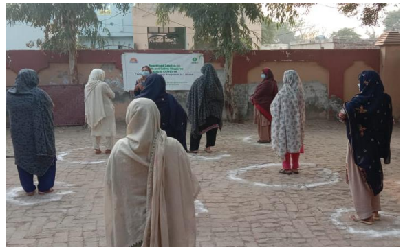
Awareness session on Gender-based Violence