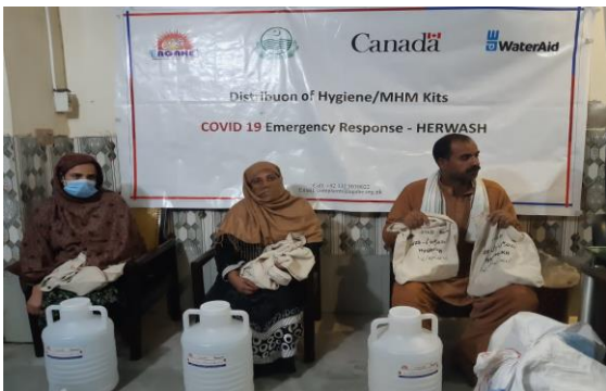
Distribution of Hygiene kits