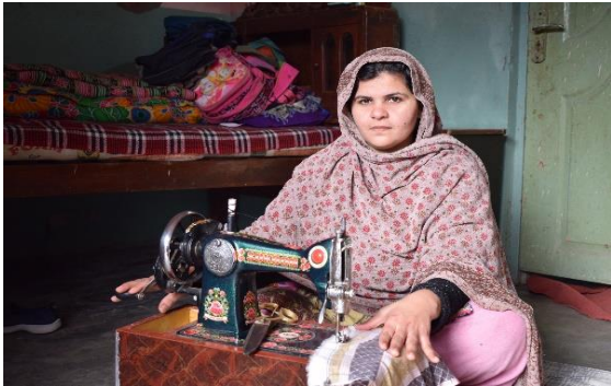
Recipient of financial assistance grant