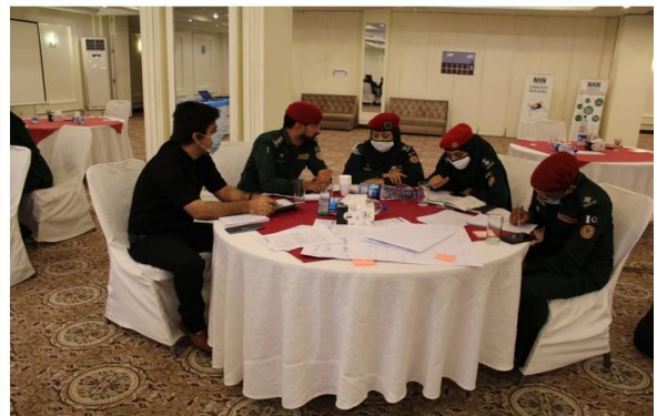
Group Work by the Participants