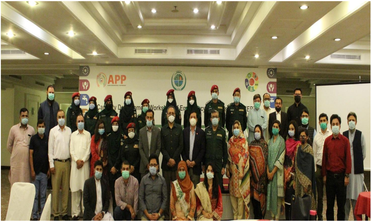
Participants' Group Photo