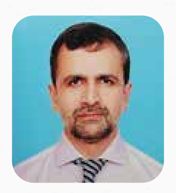
BY: SALEEM SHEHZAD MALIK

The world is passing through testing times in the annals of history as it is hardly hit by the Coronavirus pandemic disease called Covid-19. As many as 12.750 million people have so far been diagnosed Covid-19 positive with more than 566,356 recorded deaths to date across the globe. Pakistan is no exception where 251,625 people have so far been tested positive with 5266 deaths caused by Covid-19. (as of 13 July 2020)