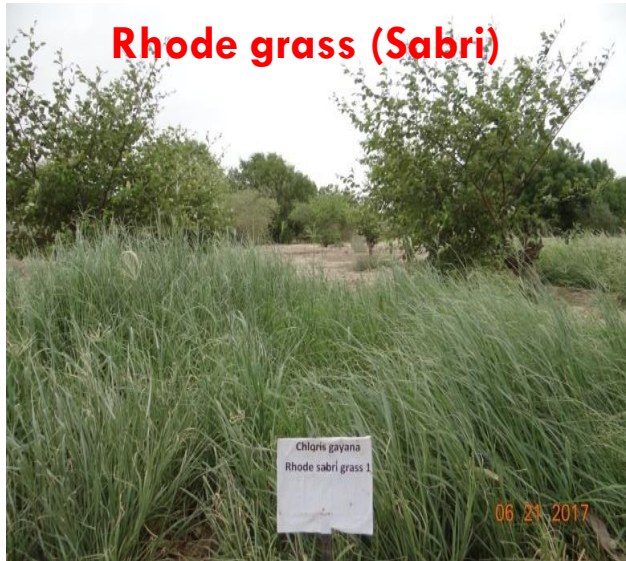
Rhode grass (Sabri)