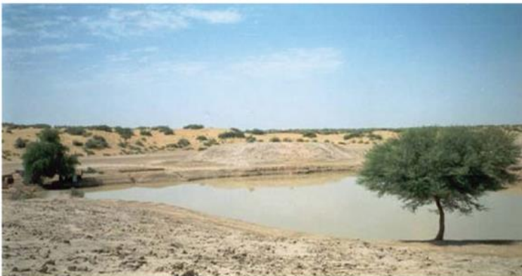
Figure 4. Adaptive approach for local toba