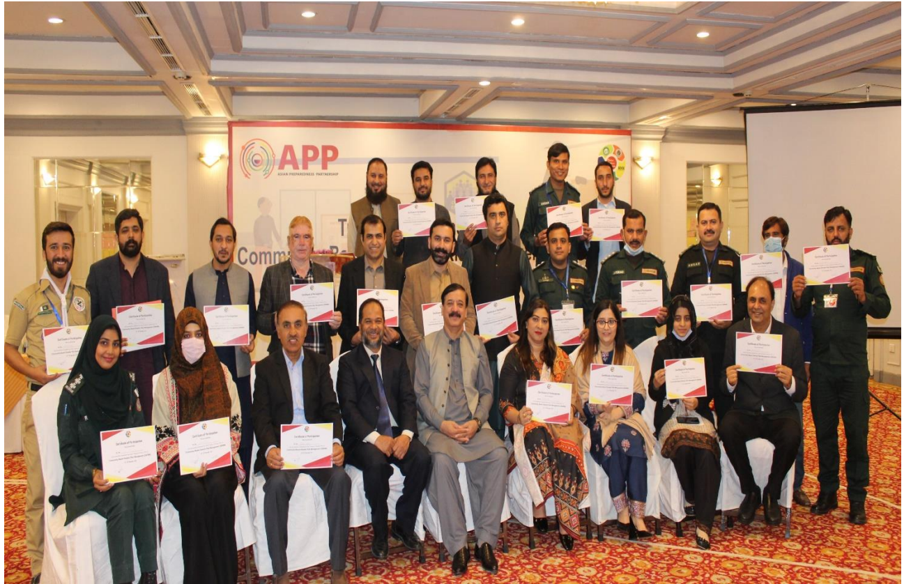
Participant's Group Photo